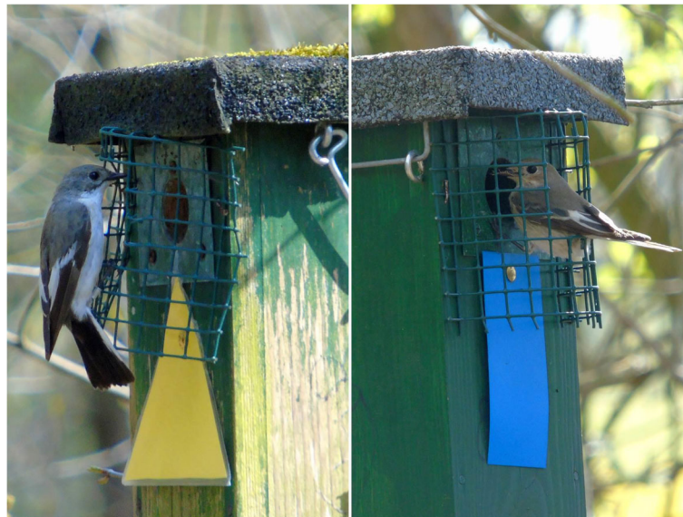
Fig. 1 A male Pied Flycatcher at a nest box with a yellow triangle symbol (left panel), and a female at a nest box with a blue rectangle symbol (right panel)

setup between 2014 and 2016. In 2014 the symbols were left as they were implemented on the day the experiment started, whereas in 2016 we gave newly arrived flycatchers a flycatcher symbol when they had settled at a nest box with tit symbol. This meant that flycatchers always had a flycatcher symbol in 2016, whereas some had a tit symbol in 2014 (7.4% in the tit dominated area, 4.3% in the