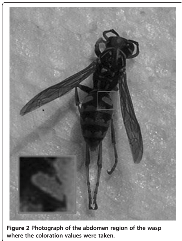
Figure 2 Photograph of the abdomen region of the wasp where the coloration values were taken.

greater the luminance (brightness) for that channel; for example, the coordinate 0, 0, 0 indicates black and 255, 255, 255 indicates white. Using the photographs, we also measured the length and width of the wasp abdomen, and the head width, using the program Image J [37]. Subsequently, the poison gland was removed from the wasp, and its diameter was measured three times, using the average of these three measurements in the analyses. For each case, all measurements were taken by the same researcher.