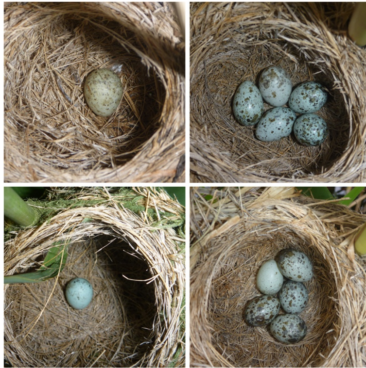
Figure 3 Representative nests of great reed warblers with natural common cuckoo parasitism: two nests parasitized in the pre-egg laying stage (on the left), and two nests with cuckoo eggs in complete clutches (on the right). In the latter nests the cuckoo egg is in the middle of the top positions (above), and in the left top position (below).

following the method of [61], based on [62], as second year (young, first time breeder) or after second year (older breeder).